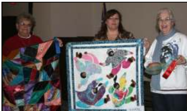
Alternative Art winners