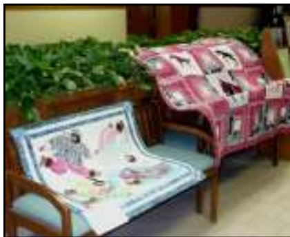
Quality quilts entered in the OWL Art Contest