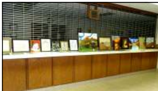
How many OWLs does it take to set up a show?