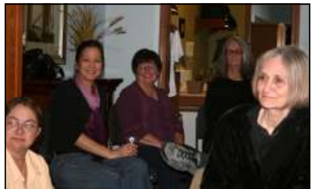
Women of OWL share secrets of storytelling

After the lunch and auction, the workshop will continue at 2:00 p.m.